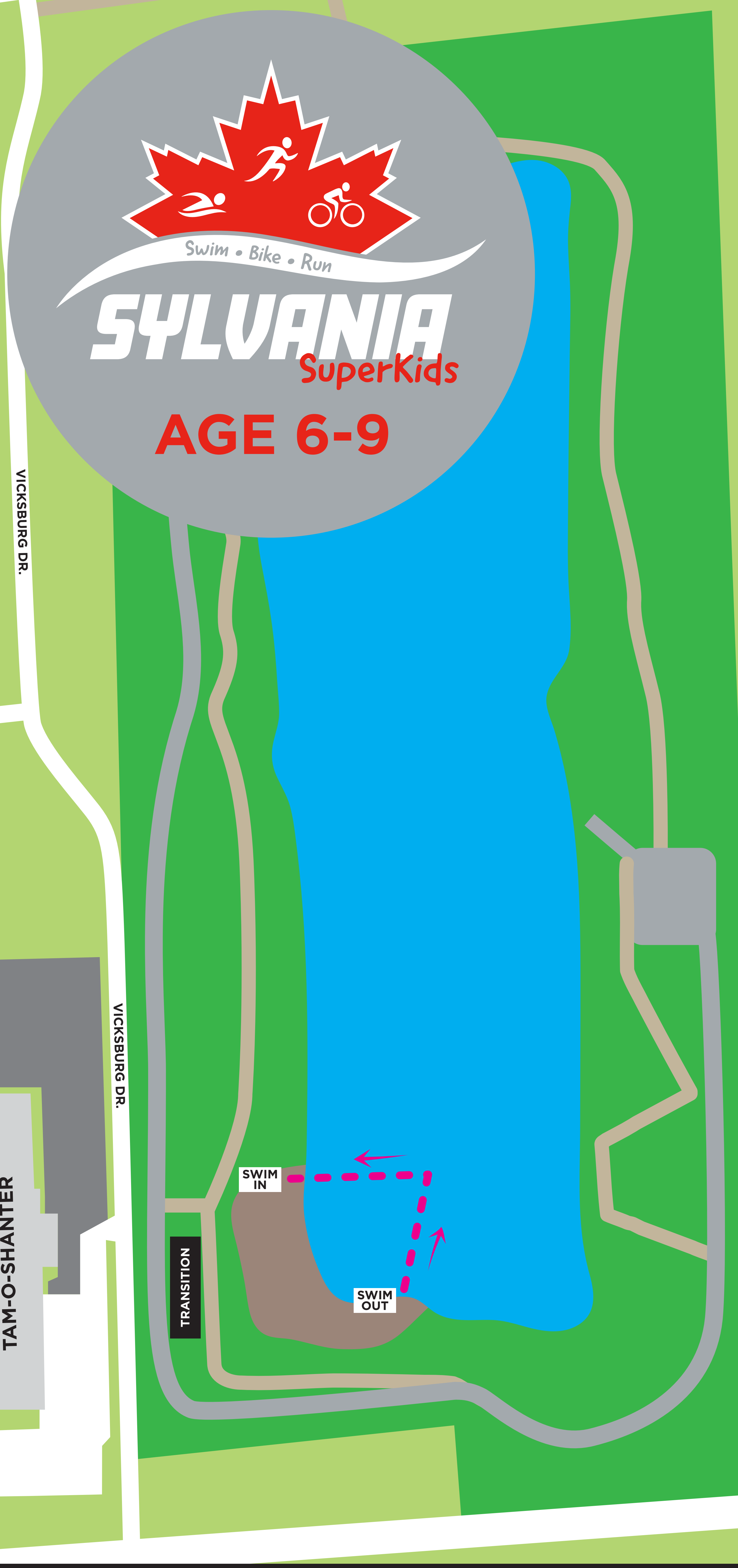
100 YARD SWIM